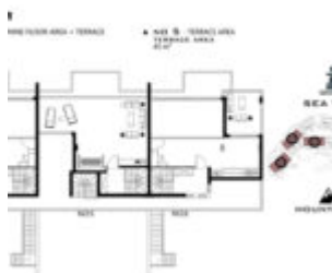
Mezzanine Floor Plan