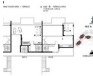
Mezzanine Floor Plan